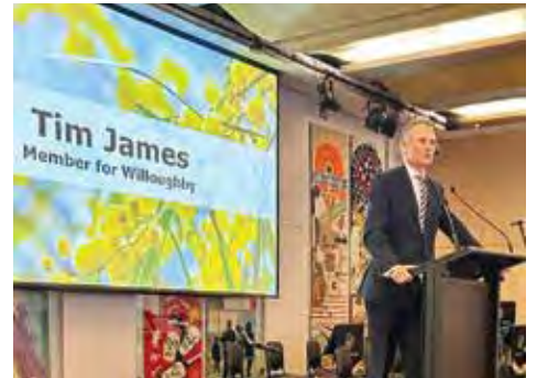
Welcoming our newest citizens on Australia Day