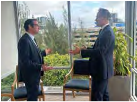
Discussing health priorities at North Shore Private Hospital