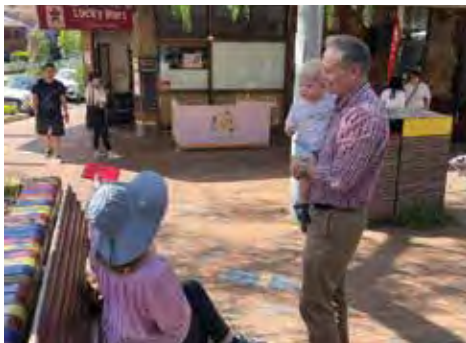
Listening post in Artarmon