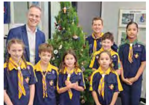
1st Northbridge Sea Scouts decorating the office Christmas tree