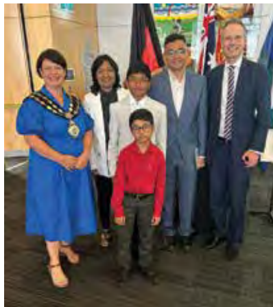
Willoughby Council's Australia Day Citizenship Ceremony

Welcoming our newest citizens at local citizenship ceremonies is always a highlight. It was particularly special to celebrate with 100 new Australians from around the world who took the oath in Chatswood on Australia Day. Unfortunately, North Sydney Council has chosen to end the tradition of holding an Australia Day citizenship ceremony. Welcome to all our new Australians, thank you for calling Australia home and for everything you bring to enrich our community.