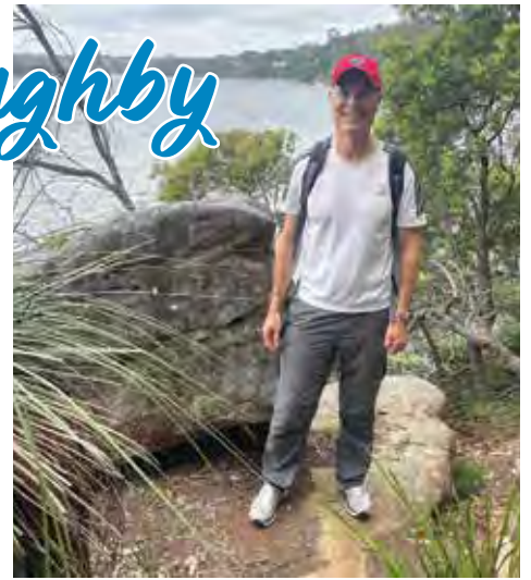
Walking the bush tracks of Middle Harbour