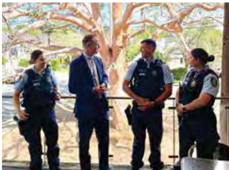
Meeting new local probationary constables