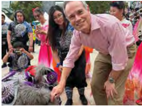
Celebrating Lunar New Year