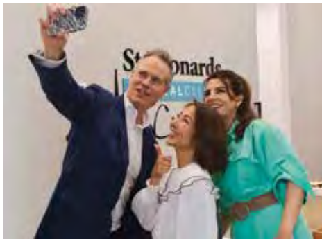
Opening the new St Leonards Medical Clinic